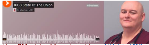
Hear Bill's state of the union address: bit.ly/uhp1608sou .