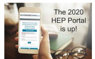
The 2020 HEP Portal is up!

The Health Enhancement Program portal offers access to what you and your family need to do to stay compliant, avoid additional premiums, and plan to avoid the late-year appointment rush: bit.ly/HEPportal .