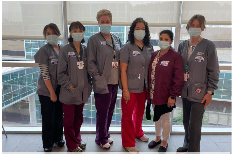
#FundOurFutureCT: Members in the Outpatient Pavilion take part in the SEBAC sticker campaign to demand fair contracts for all state employees.