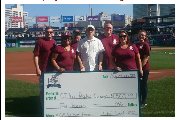
UHP at the Yard Goats, Aug.5, 2018

At the end of this summer, UHP is going back to the Yard Goats on Aug. 25 , and it is Wizarding day! So bring your wands and support our community outreach project for End Hunger.