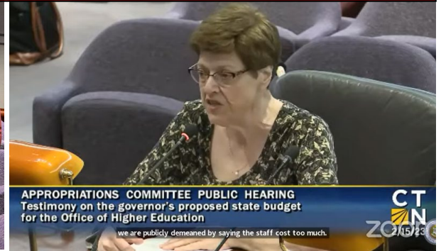
APPROPRIATIONS COMMITTEE PUBLIC HEARING Testimony on the governor's proposed state budget for the Office of Higher Education